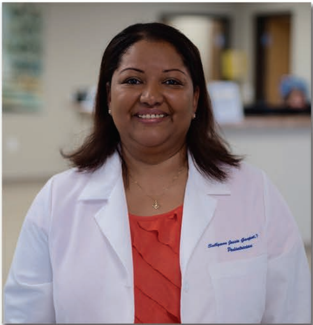
Board Certified Pediatrician